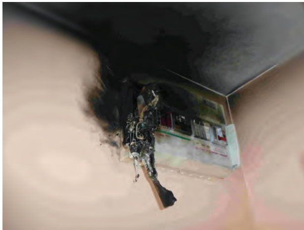
Result of DIY work by a home owner where a 10.5 kW electric shower was connected to a 45 A circuit-breaker using 2.5 mm 2 cable.