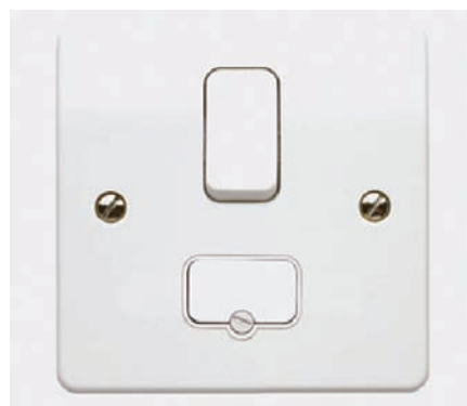
Figure 2: Example of a method of permanent connection to fixed wiring - a fused connection unit