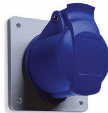
Figure 3: Example of connection using socket-outlet to BS EN 60309-2